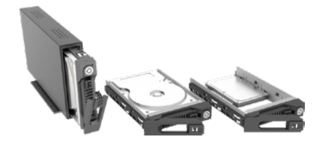
★ Spare removable drive tray available

With one easy-to-use Disk Tray, GT1670 supports any kinds of 3.5" & 2.5" SATA HDD/SSD. And with the aluminum housing, it can protect your data and with the excellent heat dissipation. Since this easy-to-use Disk Tray is dimensional compliant to all our Stardom products, you could easily transfer your data among different storage devices. And also, its key lock design could provide a double protection at your data from any improper Tray extracting.